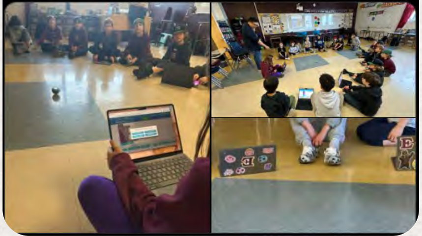
Grade 4 coding! @edgeschool