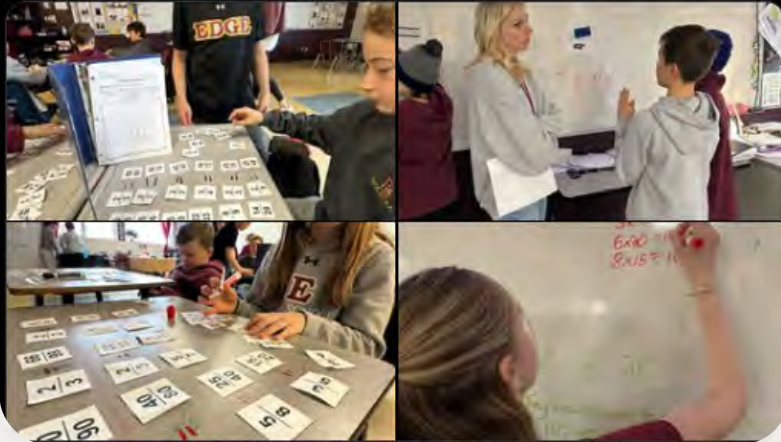
Mathy mathiness. @edgeschool