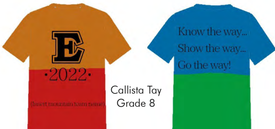
Callista Toy Grade 8