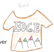
Amelia Witwer Grade 4